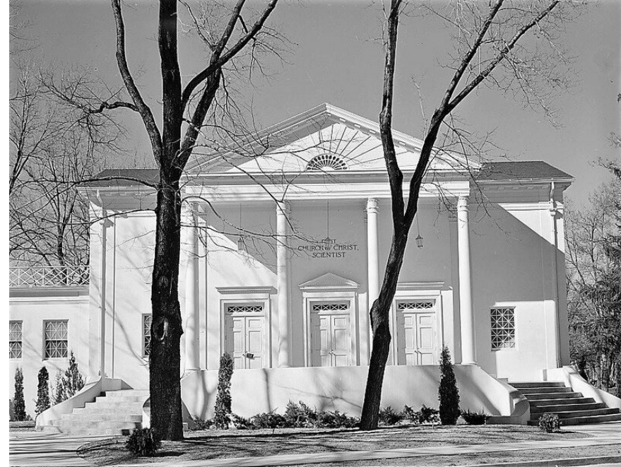
First Church of Christ, Scientist, Reno (listed in the National Register of Historic Places in 1999)

Buildings in a district can be “contributing” or not - if contributing, they are considered listed in the NRHP.