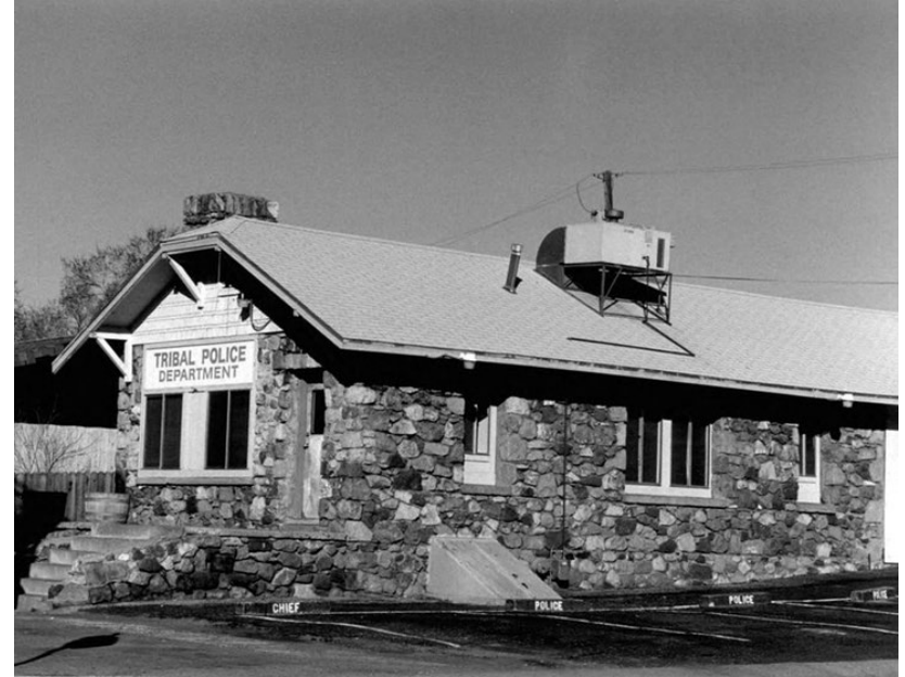
Field Matron's Cottage, Reno-Sparks Indian Colony (listed in the National Register of Historic Places in 2003)